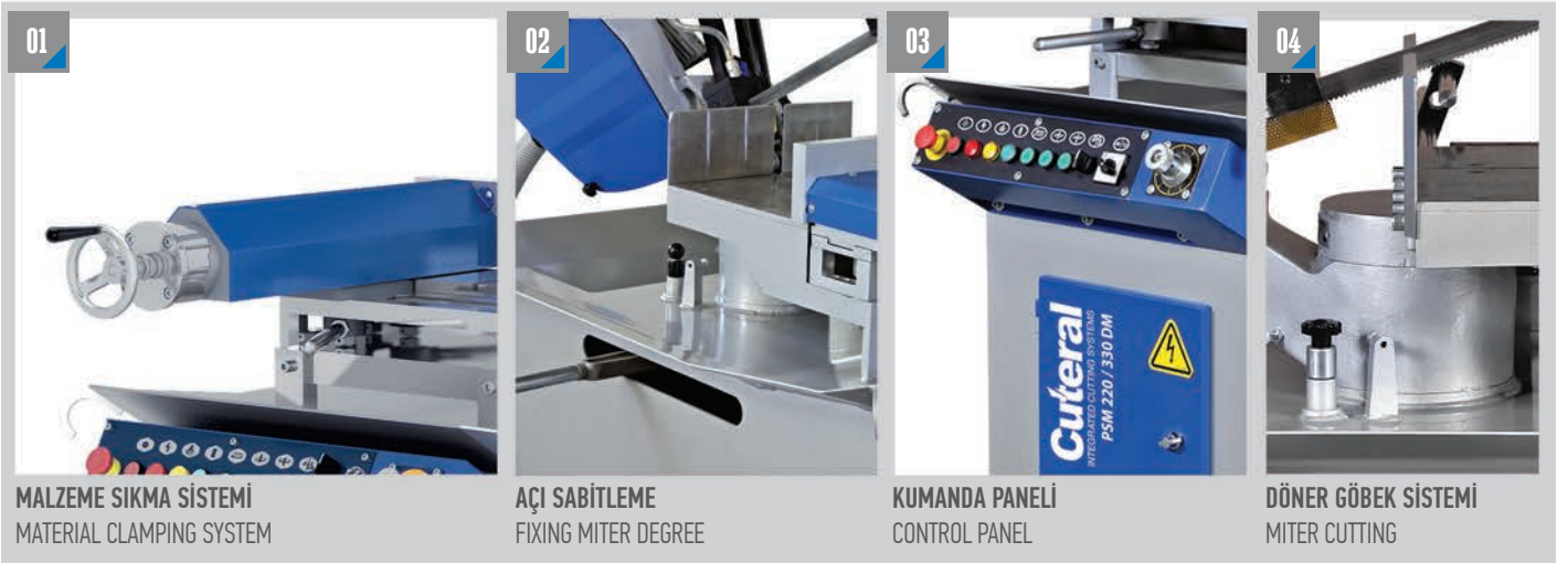
01 MALZEME SIKMA SİSTEMİ MATERIAL CLAMPING SYSTEM