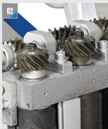
MALZEME SÜRME SİSTEMİ MATERIAL FEEDING SYSTEM