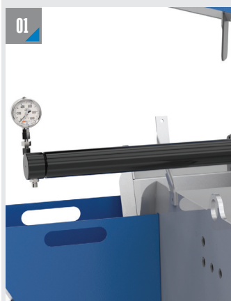
MALZEME SIKMA SİSTEMİ MATERIAL CLAMPING SYSTEM