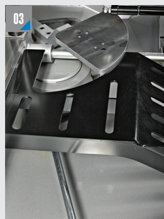
AÇI KİLİTLEME MITER FIXING