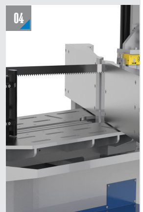
AÇILI KESİM MITER CUTTING