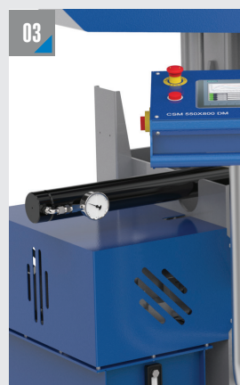
MALZEME SIKMA SİSTEMİ MATERIAL CLAMPING SYSTEM