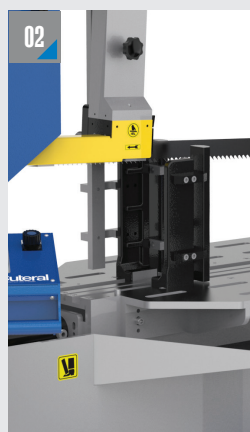
MALZEME SÜRME SİSTEMİ MATERIAL FEEDING SYSTEM